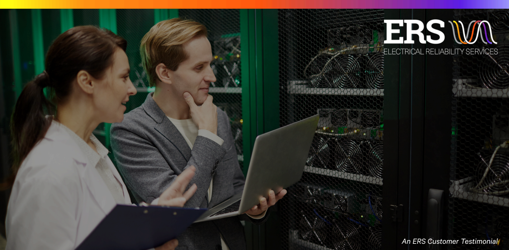
An ERS Customer Testimonial